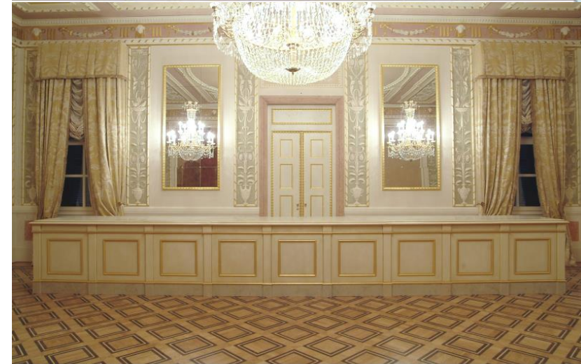
Teatro La Fenice - Sala Dante